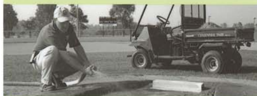
Step #2: Lightly water and allow to soak in.