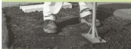
Step #3: Apply 1" Pro Mound and tamp to compact. Repeat steps 2-3 to within 1/2" of finished grade.