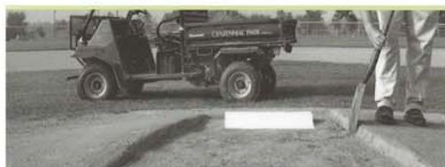
Step #1: Remove top 4-6" of top soil.

Ask about our entire team of sports field products for top performance on your baseball, football and soccer fields.