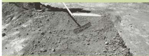
Step #4: Cover with infield mix, tamp and finish with Pro's Choice infield conditioner.